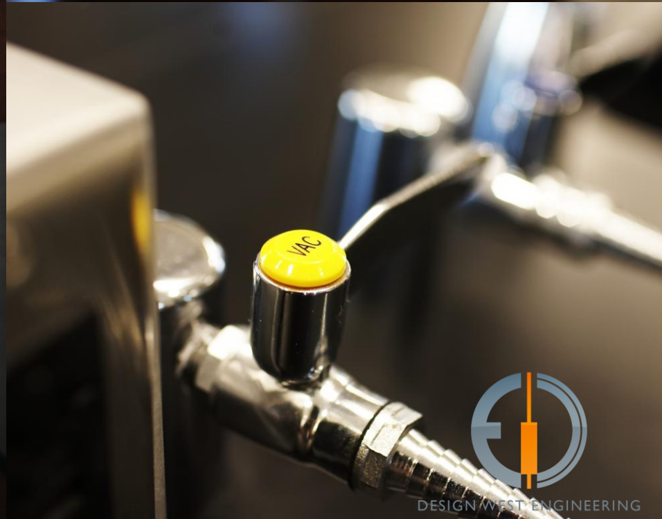
California Baptist University James Building - Chem Lab Riverside, CA